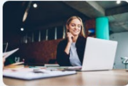
Principles of Pre-Award Research Administration