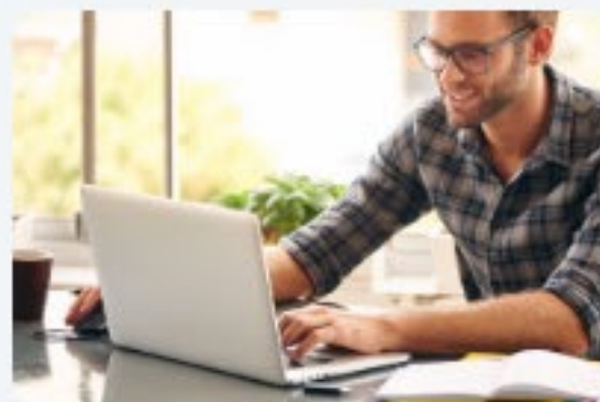
Research Compliance Frameworks