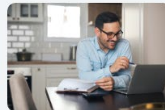
Relationships, Roles, and Responsibilities in Research Administration