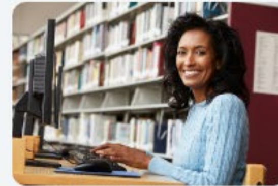
Principles in Research Development