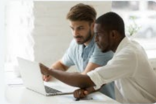
Principles of Award Negotiation and Set-up