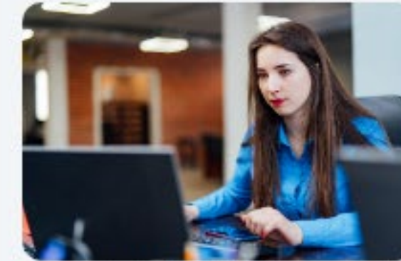
Principles in Proposal Development